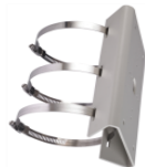
DS-1275ZJ Vertical pole mount